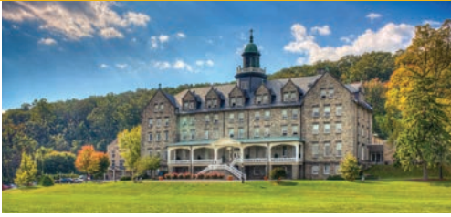
Mount St. Mary's Seminary.

demeaned and, worse, remained uneducated. The controversy over what version of the Bible to use in school inflamed nation-wide. To Hughes, public education was a right due every American, especially the poor and the voiceless.