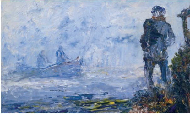
Jack Butler Yeats (1871-1957) Misty Morning 1942 Oil on panel 9" x 14"