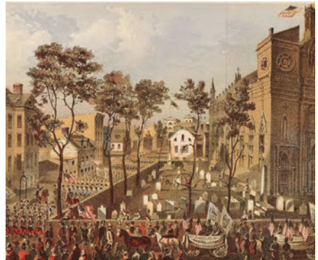
President Lincoln at Antietam, 1862. The "Fighting 69th" at St. Patrick's Old Cathedral, 1861.

69th New York militia, so impressed Robert E. Lee with their courage under fire that he called them "The Fighting 69th."