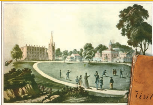
St. John's College, Fordham. Archbishop Hughes' Visitors Book. Façade of St. Patrick's Cathedral by James Renwick, Architect.